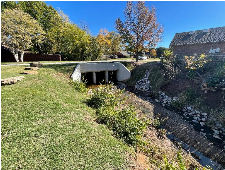
Profile View, looking east.