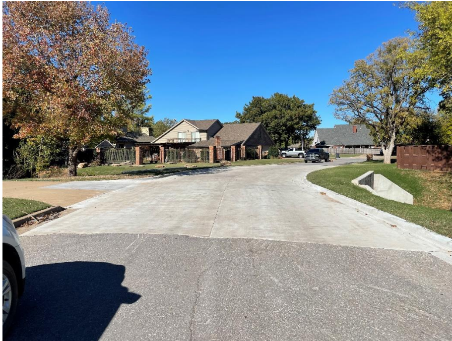
Roadway view, looking north.

County: Comanche ODOT District 7 Facility Carried: NE 29 th St Structure: 16N2598E1640006 NBI#: 33129 Feature Intersected: Trib. To Wrattan Creek